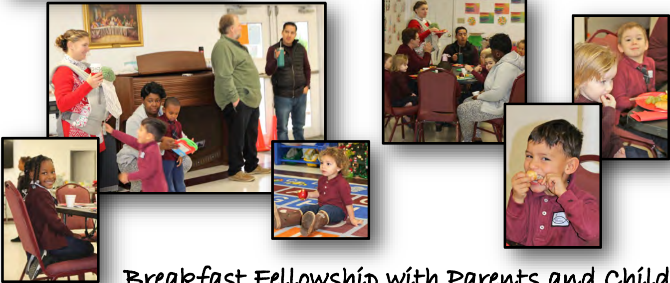
Breakfast Fellowship with Parents and Children