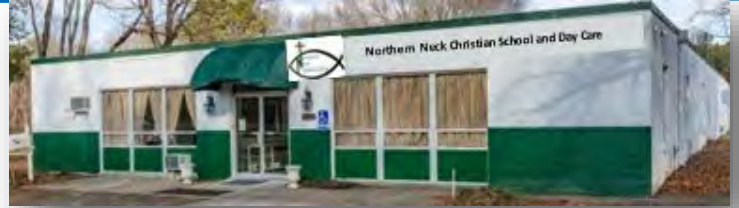
NNKCS new home in Montross

We are thrilled to announce the launch of our capital campaign in support of the Northern Neck Christian School (NNKCS). Our vision is to provide an even greater educational experience for our students and impact more lives for the Kingdom in our community. Light of Christ, with your support, we can build a brighter future together that reflects our foremost desire: To know Jesus Christ and to make Him known to others.